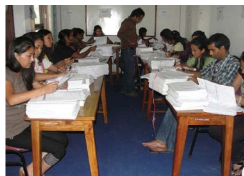
Data Management Officer closely supervising the coding of the questionnaires