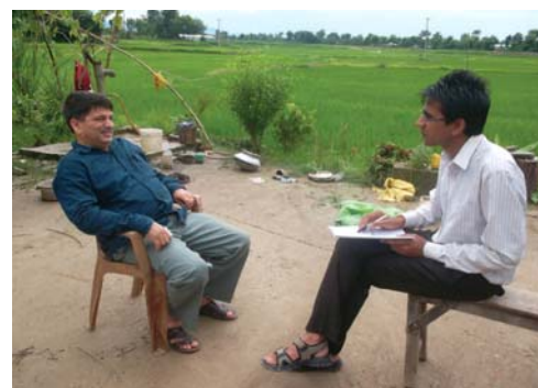
Field Researcher interviewing a household member during data collection in Kapilvastu